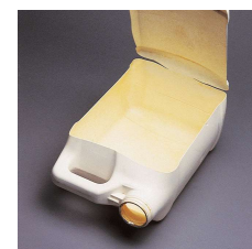
Inside stained but rinsed clean.