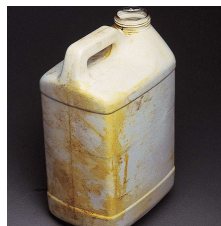
Dried formulation on container.