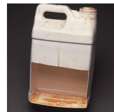
Bottom is caked with dried residue.