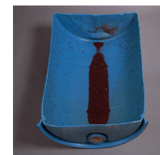
Liquid residue in container.