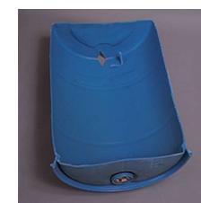
Inside is clean and dry.