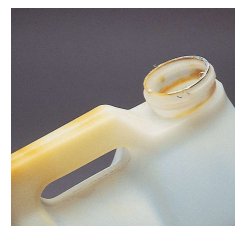
Handle and neck stained but clean.