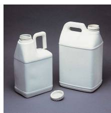
Container, thread, and lip are clean.